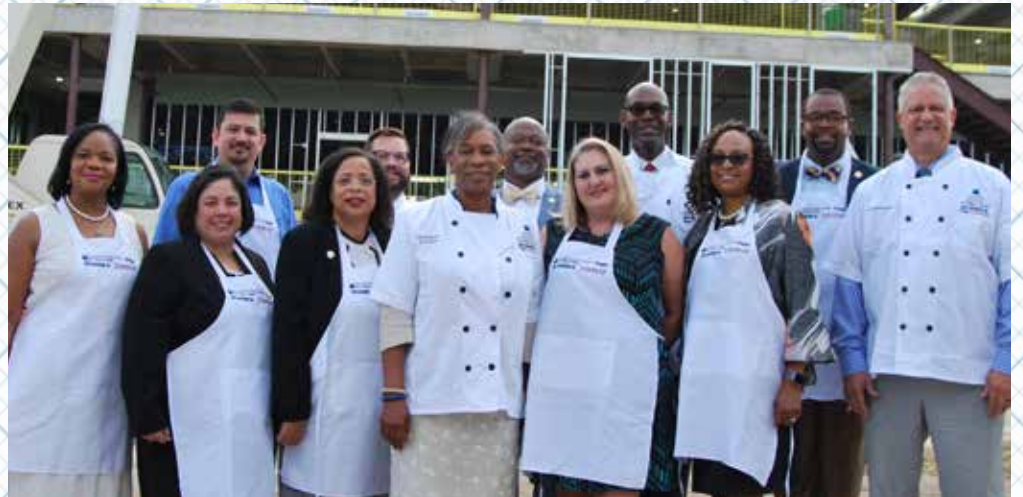
The event was the first "topping out" ceremony to be held for a project funded by the district's 2017 $450 million bond program approved by Bexar County voters. The college broke ground on the new facility in October 2018.