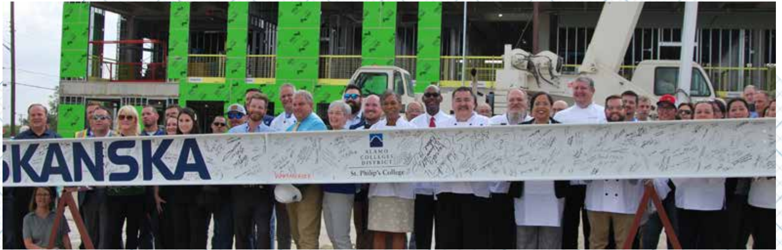
Event attendees participated in the signing of a giant steel beam which was then raised by an immense crane to the top of the area of the building where Artemisia's, the colleges respected restaurant staffed by Culinary Arts students, will be housed.