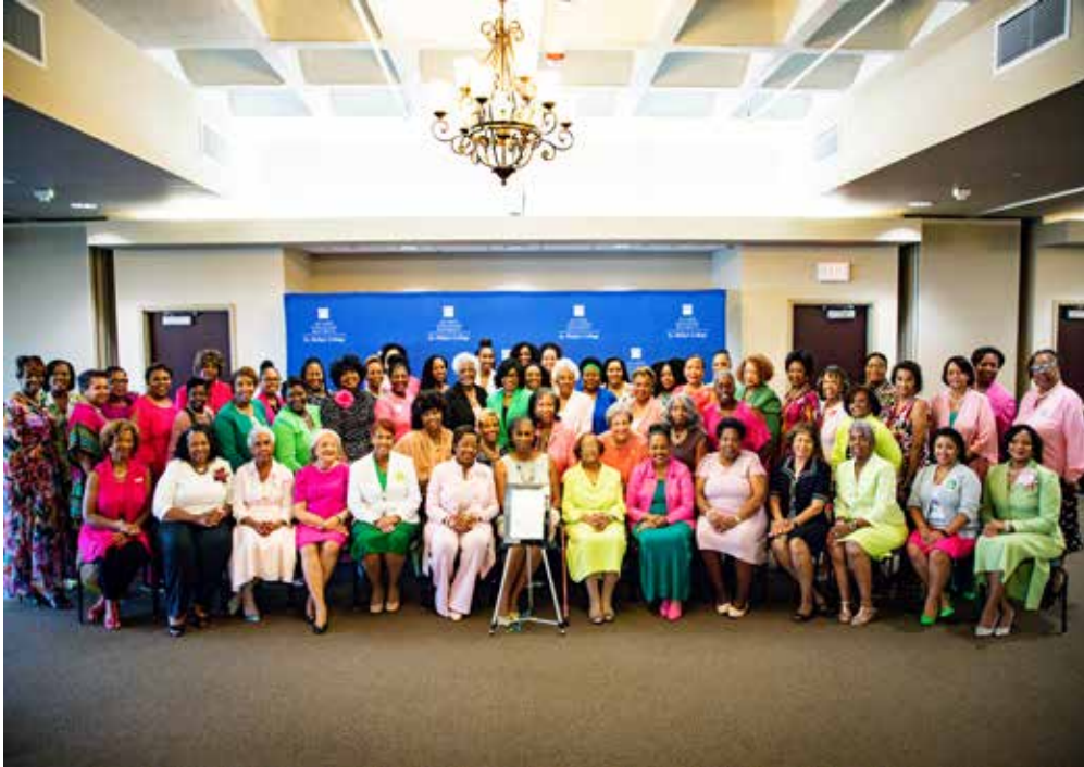
Alpha Kappa Alpha - Alpha Tau Omega chapter kicked off its Celebration of HBCU week with their adoption of St. Philip's College as their HBCU. During this monumental event, St. Philip's College recognized Alpha Tau Omega members who graduated from St. Philip's or who were previously honored as Distinguished Alumni of St. Philip's College.

Non-Profit Org. U.S. POSTAGE PAID San Antonio, TX Permit No. 1667