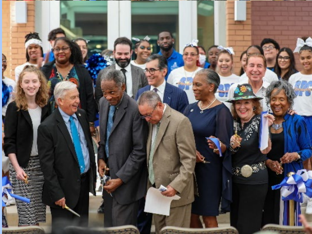
Clarence Windzell Norris Building