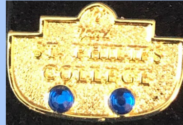
10-years of Service