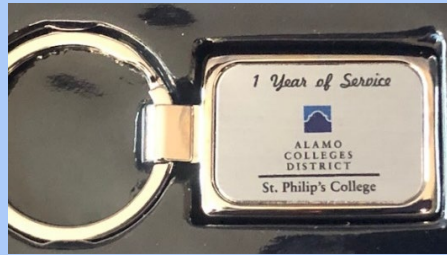
One-year of Service