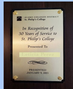
30-years of Service