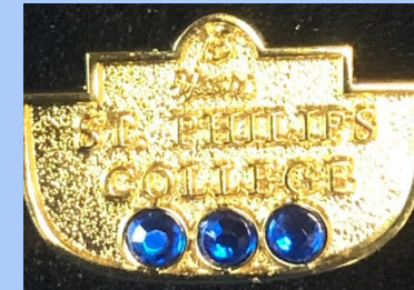
15-years of Service