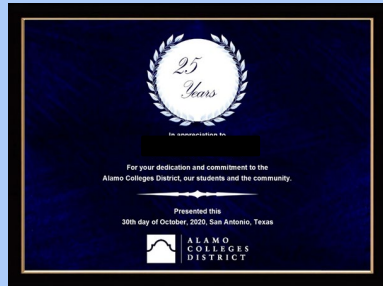
25-years of Service