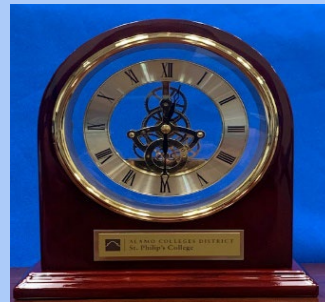
35-years of Service