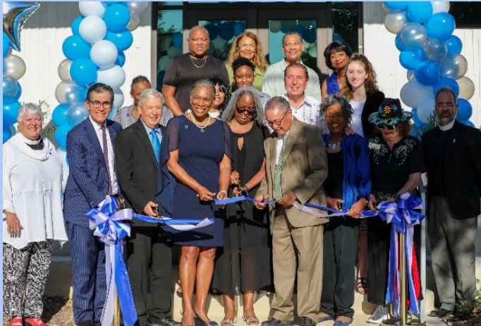
Saint Artemisia Bowden Building