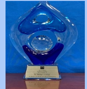
45-years of Service