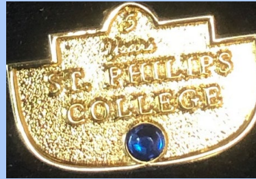
5-years of Service