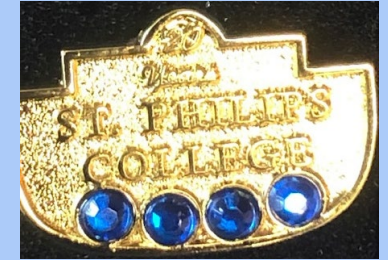
20-years of Service