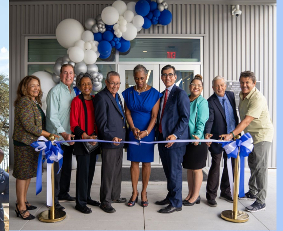
Welding & Autobody Collision Center