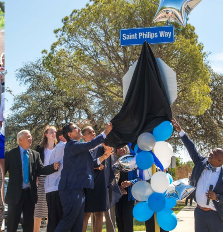
St. Philip's Way Unveiling